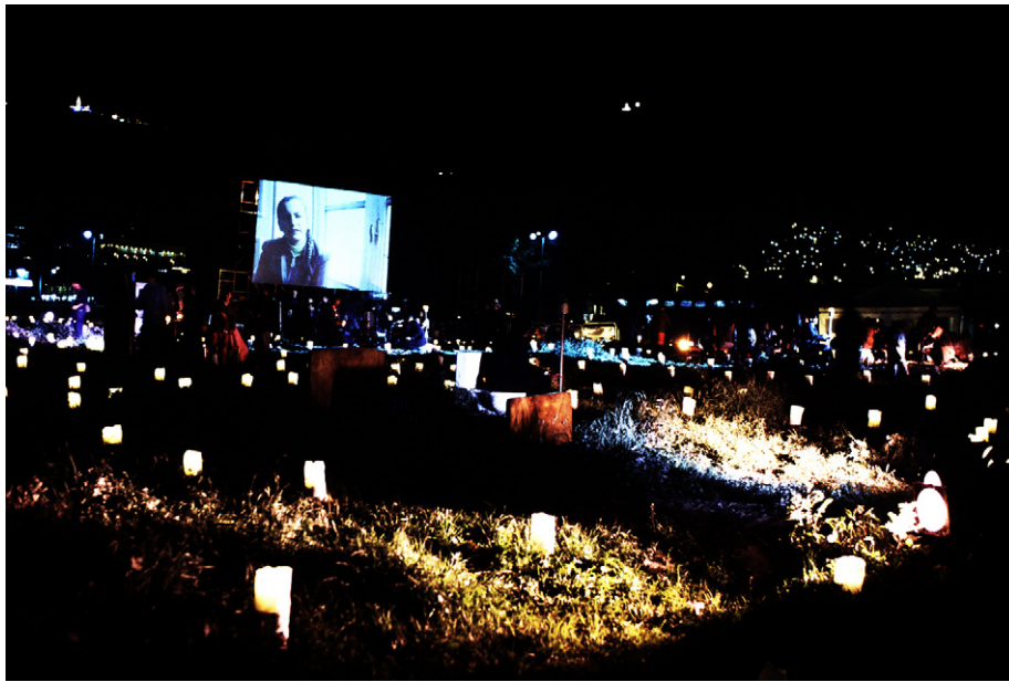
Fig. 1. Project Prometeo: Act II . Former residents of El Cartucho perform in downtown Bogotá, December 2003.

a dangerous place, known for its informal economies, sex work, and drug trade. The mayor of Bogotá from 1998 to 2001, Enrique Peñalosa Londoño, called the neighborhood 'a symbol of chaos and of government impotence'; part of his successful mayoral campaign included the promise to 'reclaim El Cartucho for the public' (Mance, 2007). Replacing a 'symbol of chaos' with the promise of a public park reinforced Peñalosa's claim to clean up the city by making it 'green' and 'sustainable'. 3 Twenty hectares (200,000 square meters), or the entirety of historic Santa Inés, was razed from 2000 to 2004, including historical buildings, streets, place-bound local economies, homes, and social networks; tens of thousands of residents were displaced without compensation. In 2005, not long after the performance of Project Prometeo: Act II , the new 'Park of the Third Millennium' was unveiled.