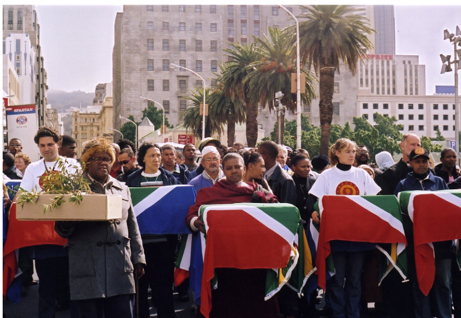
Fig. 4. 'Hands Off Prestwich Place' citizen protest actions, Cape Town, South Africa, 2003.

To illustrate a place-based ethics of care I return to the opening performance of Project Prometheus to describe creative practices based in what I would call an ethnographic responsibility of giving back to those who share their stories and understandings about place. Project Prometheus was one of five multi-year collaborative projects that constituted the series Art, Memory, and the City by the artistic collaborative Mapa Teatro Laboratory of Artists and El Cartucho residents during 2001–2005, during and after homes and neighborhoods were razed ( Mapa Teatro Laboratoria des Artes , nd). The initial stages of Project Prometheus were tied to a larger initiative