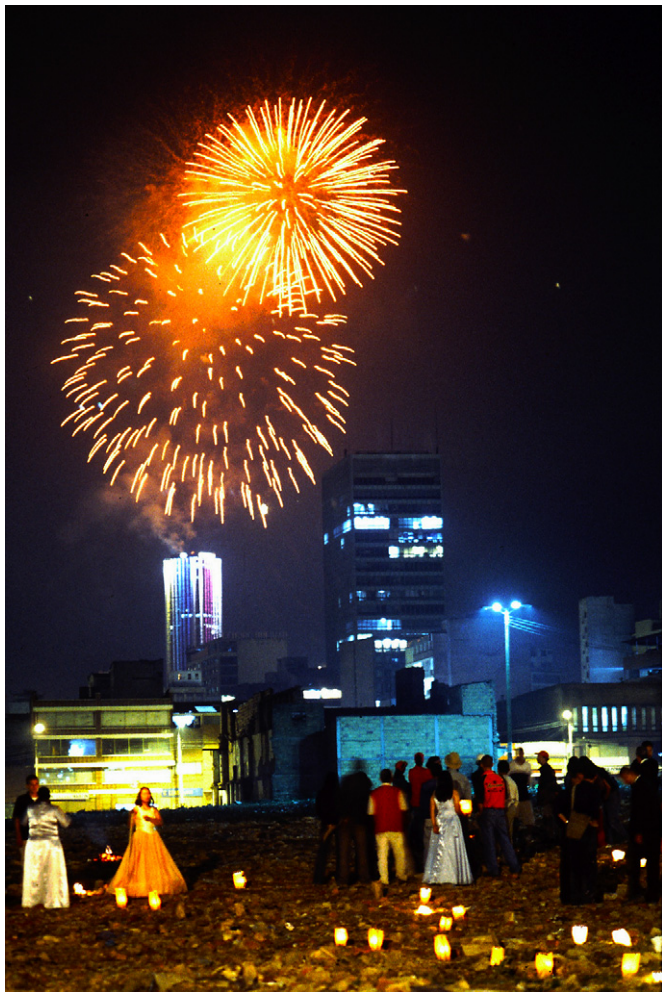
Fig. 2. Project Prometeo: Act II. Former residents of El Cartucho perform as a place-based act of care; downtown Bogotá, December 2003.

When models of the city that implicitly assume that neighborhoods are parcels of property circulating through networks of the global economy are privileged, inhabited places are treated as empty stages upon which the drama of conflict over future development potential takes place; residents, at best, are treated as victims. Perhaps for this reason, a number of scholars maintain that so-called slums, as well as suburbs, central business districts, and retail spaces, must be theorized as constitutive of, not aberrant to, the city (Bayat, 2000; Holston, 2007; Pieterse, 2008; Simone, 2010). To address the persistent problems of urban inequality, privileged network infrastructures, and unequal forms of citizenship, Pieterse (2008) argues that the everyday 'must be the touchstone of radical imaginings and interventions' (p. 9). For example, the numerous, often contradictory, everyday processes, mobilities, and practices that residents living cities of the global South use to 'just get by' are